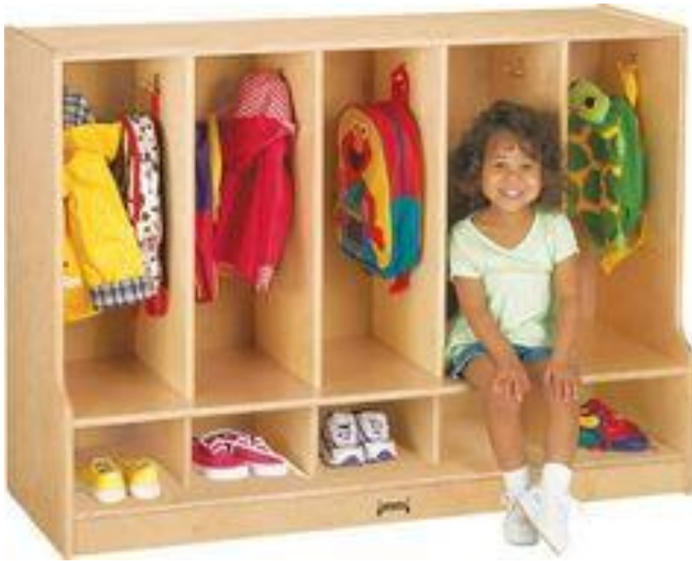
Drawing 5: Length: 7.5 feet, height 4.5 feet, depth 1.5 feet