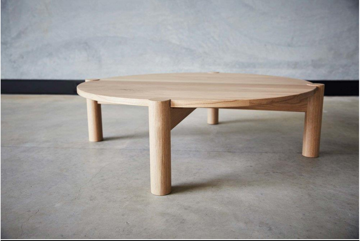
Circular table design sample