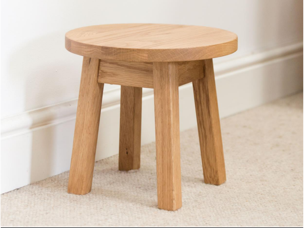
Wooden stool sample