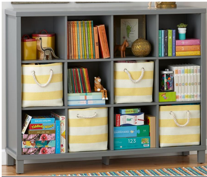
Picture no: 2 (Dimension: Length 6 feet, height 4.5 feet, depth 1.5 feet)