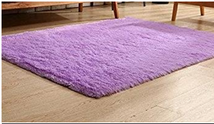
Fluffy carpet sample