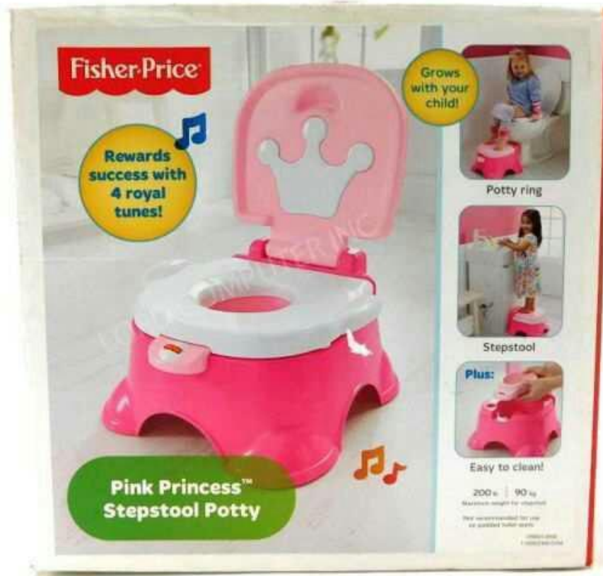
Fischer price potty sample