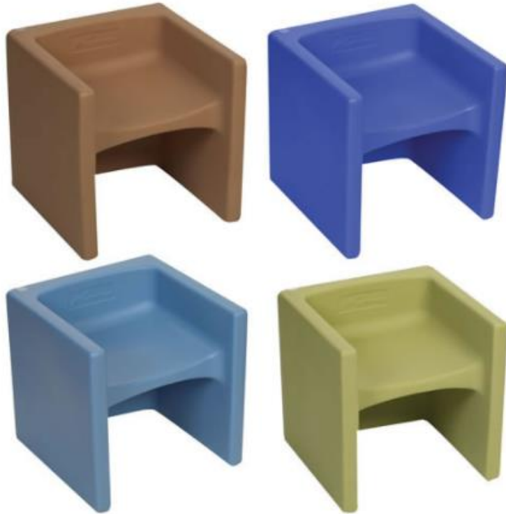
Sample: Wooden cube chair, Dimension: (1.5 feet by 1.5 feet by 1.5 feet)