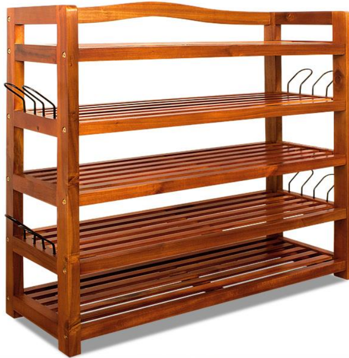
Drawing 3: Dimension Length: 6 feet, height 4 feet, depth 1 feet